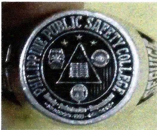
Engraved on top of the ring is the PPSC logo