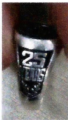
Engraved One side of the ring is the 25 or 20 years