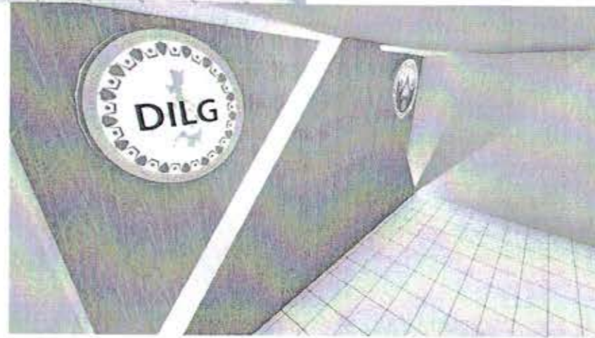
1 PERSPECTIVES A-02 SCALE NTS